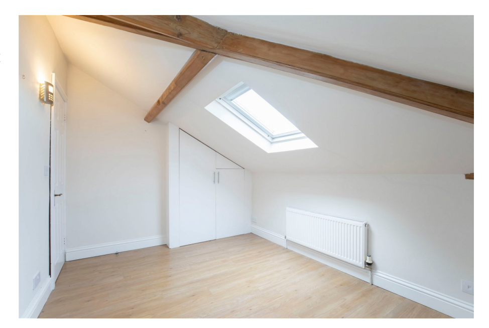
936 sq.ft. (87.0 sq.m.) approx.

A stunning two bedroom apartment that is spacious throughout and offers no onward chain. It boasts fitted wardrobes in both bedrooms as well as a large kitchen/dining area.