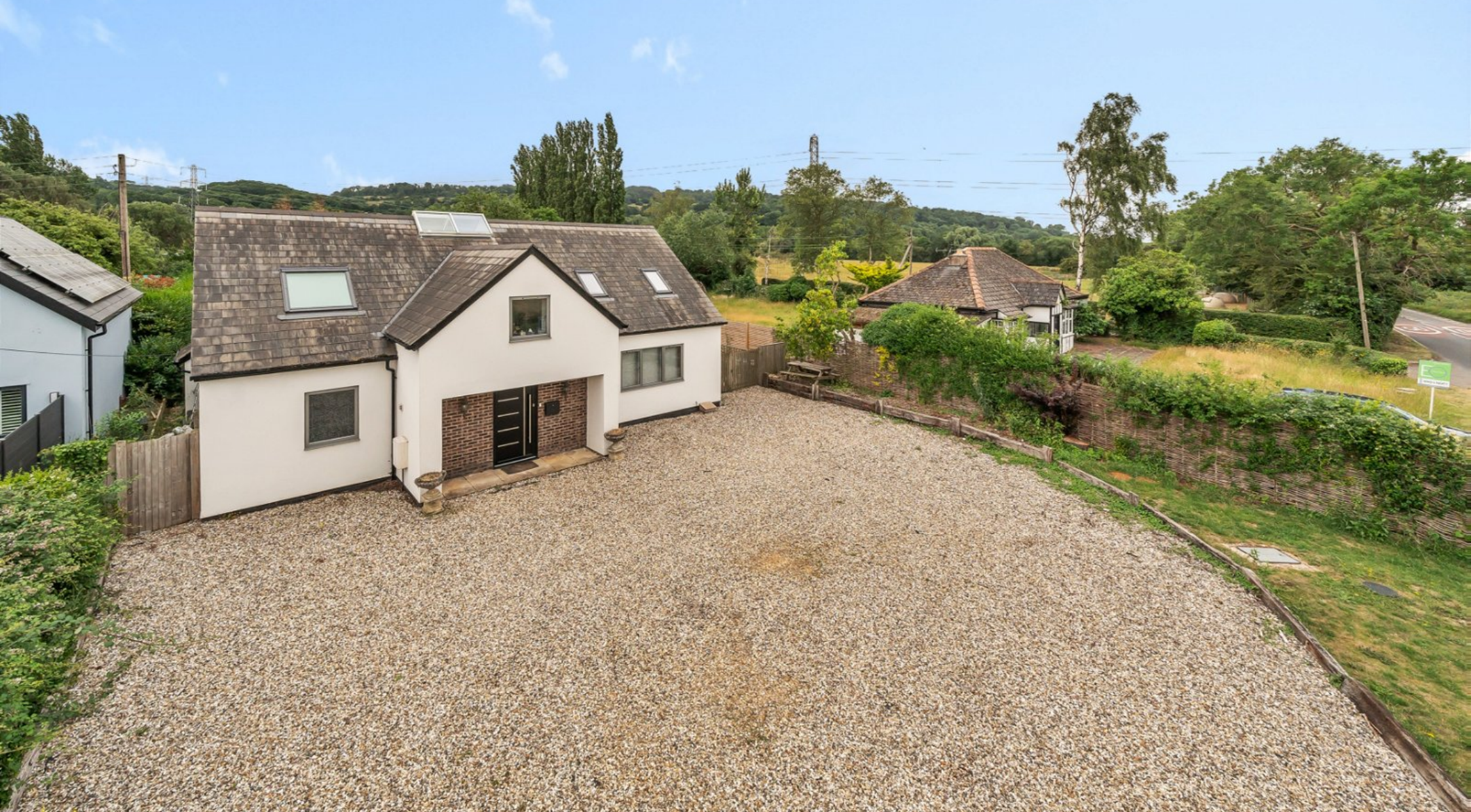
Floreat, Church Road, Leckhampton